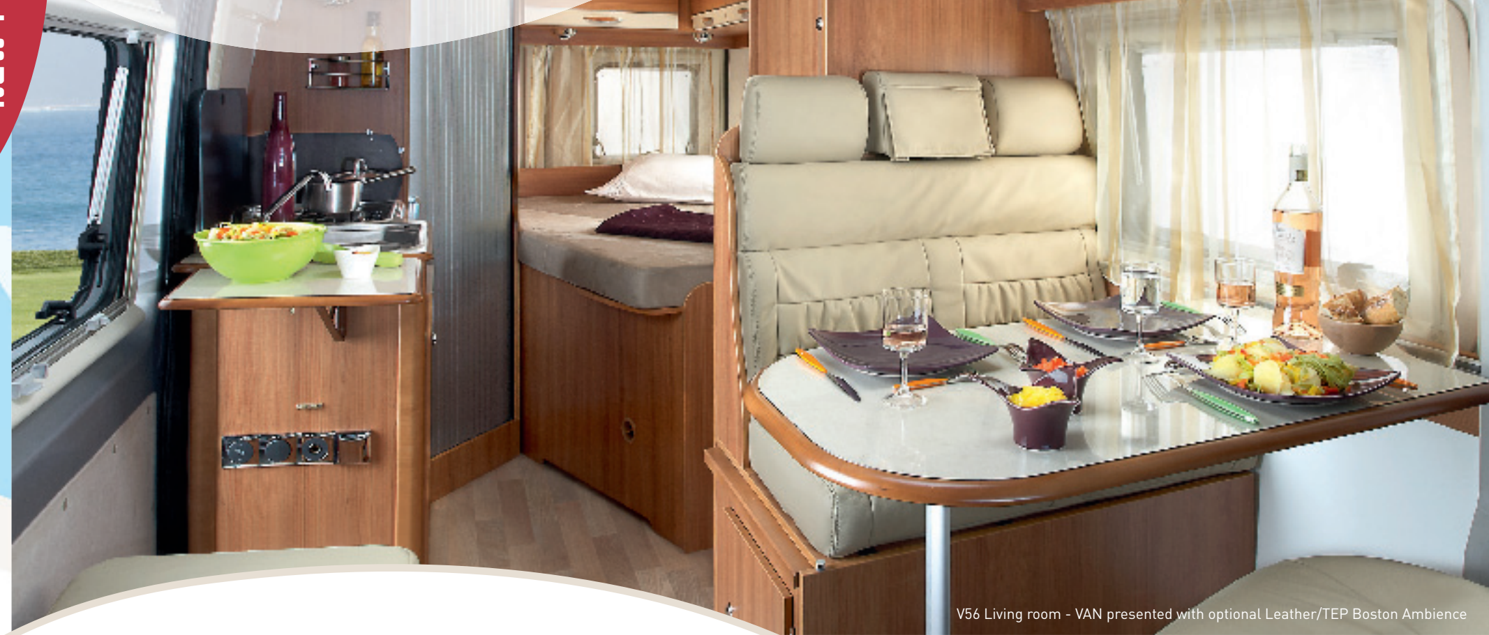
V56 Living room - VAN presented with optional Leather/TEP Boston Ambience

With 50 years experience in the development of motorhomes, RAPIDO puts all its expertise in this new VAN. Its polyester shell matches the smallest internal shapes (specific insulation) and allows to enlarge space. The result is both comfortable and functional: a perfectly calculated circulation space and an optimal arrangement of four living areas. You'll enjoy a large living room for five guests, a kitchen, 4 beds (including 2 for children) and a real bathroom. Harmony Furniture brings a breath of freshness to your home. Add your personal touch by choosing one of three optional fabrics. Once you set foot on the electric instep, you immediately feel at home.