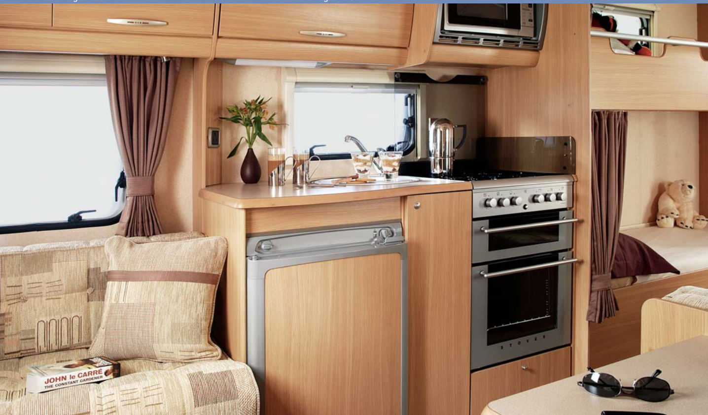
Above: Vogue 600

Exteriors offer one-piece, thick gauge, high gloss, aluminium sidewalls, 6'5" headroom and on some models, 7'6" wide bodyshells, while alloy wheels and a Status 530 directional TV aerial come as standard.