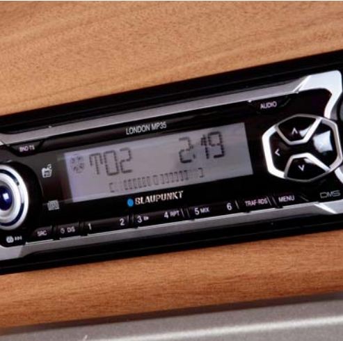
Above: Radio/CD/MP3 Player (optional extra)