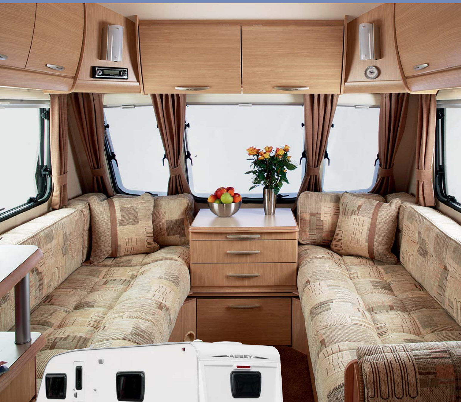
Left: Vogue 620