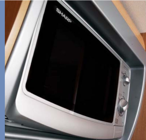
Above: Microwave (optional extra)