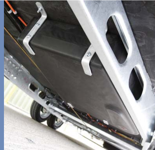
Above: Insulated Water Tank (twin axle models)